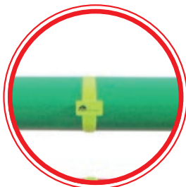
Roll clips REF : PHTIASR